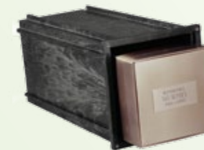
Urn in Niche Sample