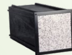
Niche with Facing Stone

Inurned Niche with Memorialized Facing Stone